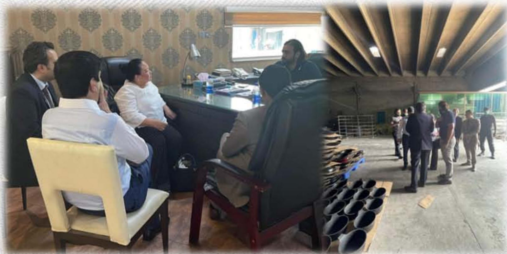
Philippine delegation while visiting the Sonex Cookware