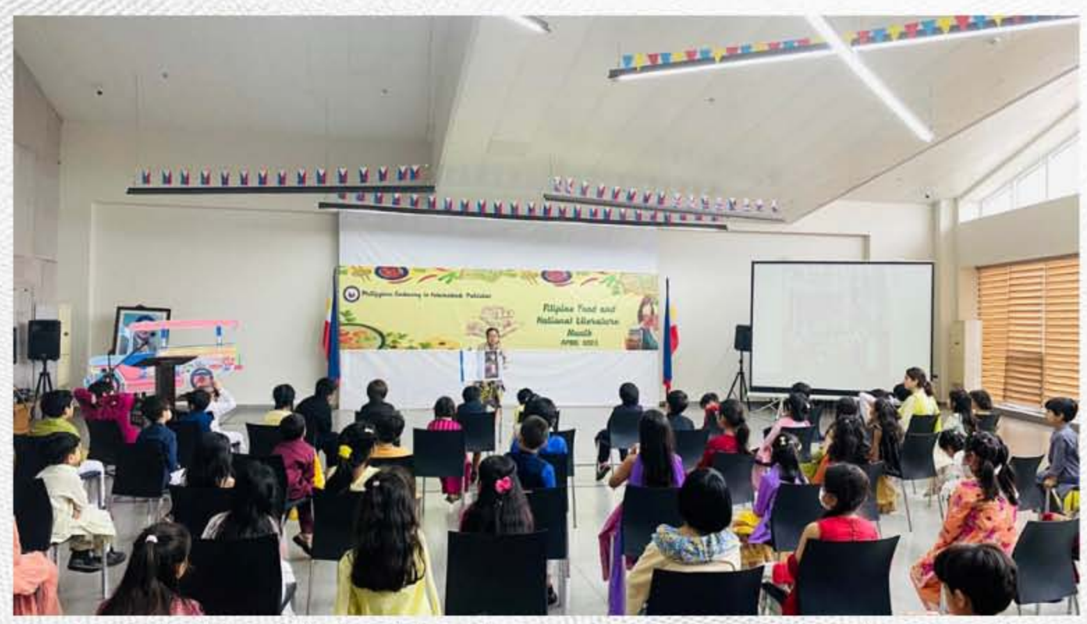
Vice Consul Chryzl T. Sicat facilitated the book reading activity to seventy (70) Grade 1 students of PSI.