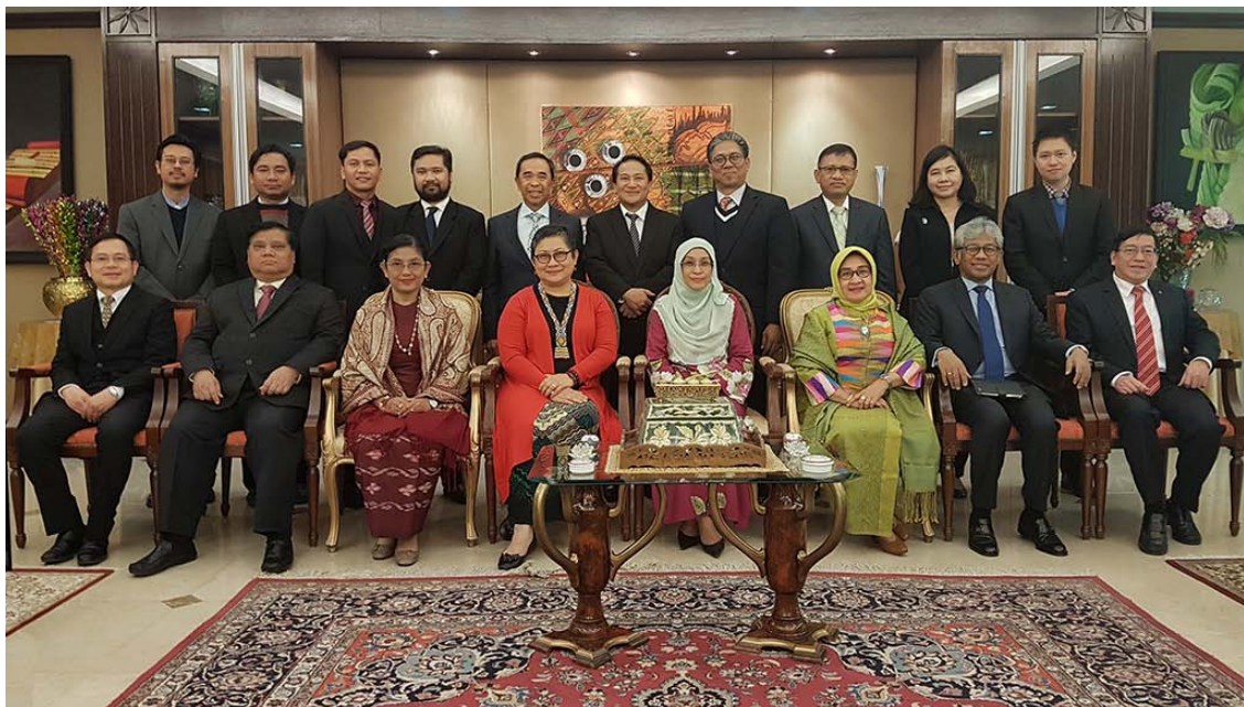
The ACI Members with their respective deputies and spouses.

The ACI is comprised of seven Heads of Mission of ASEAN Member States with permanent mission in Islamabad namely: Brunei, Indonesia, Malaysia, Myanmar, Philippines, Thailand and Viet Nam.